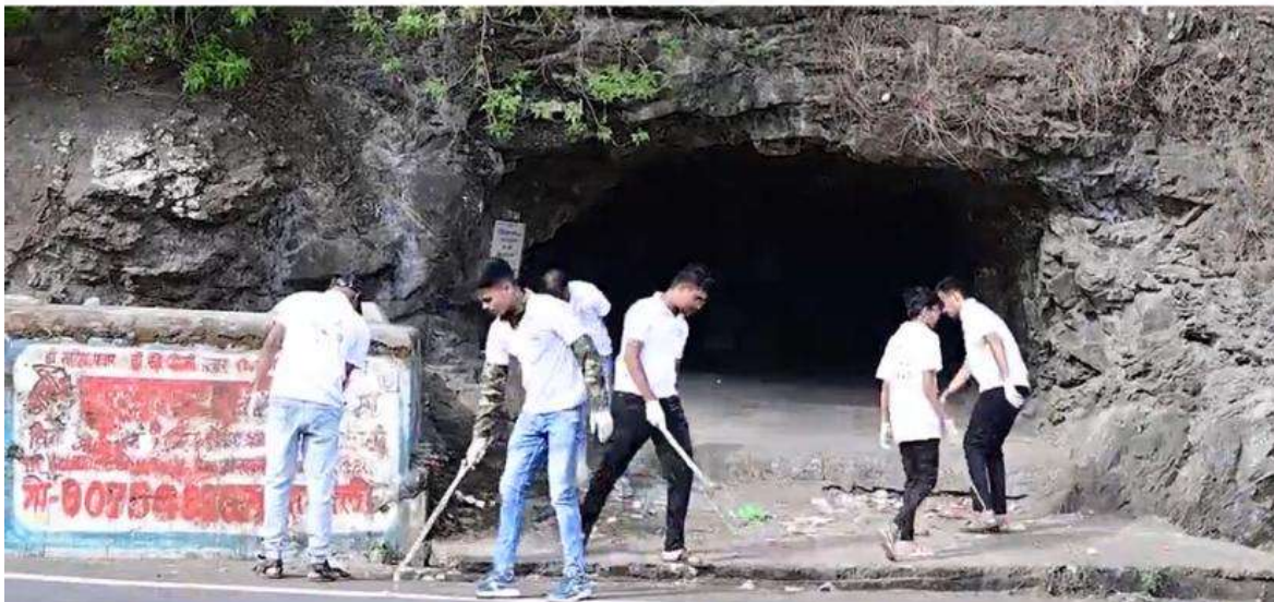
Every Year After Pilgrimage College organises the Cleanliness Drive from Dive ghat to