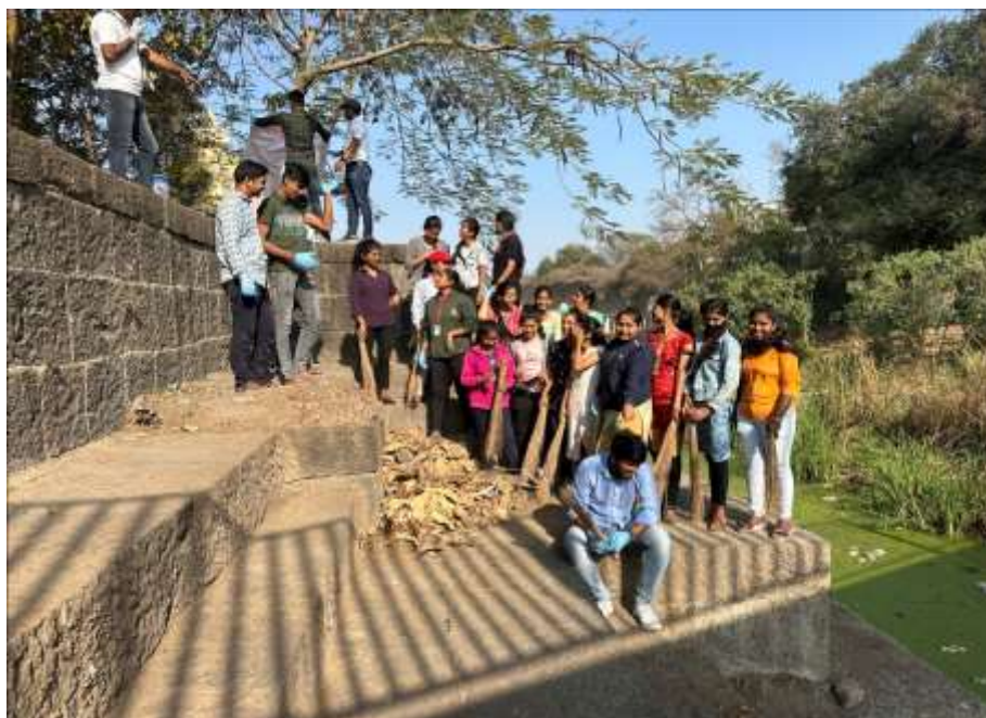
Karha River conservation and cleaning event (2/8/2024)