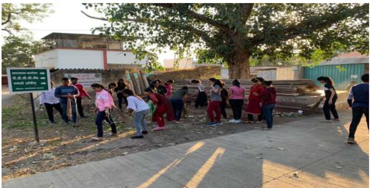
Swacha Bharat Abhiyan at Naygaon Gaon (25/5/2024)