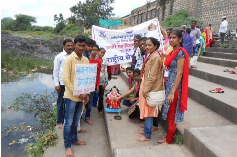
Social Awareness Rally and Street-Plays (9/12/2019)